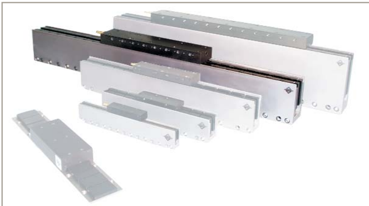
The BLMH is shown with Aerotech's linear motor line.

The BLMH can be driven using standard Aerotech brushless amplifiers and controllers to provide a complete, integrated system.