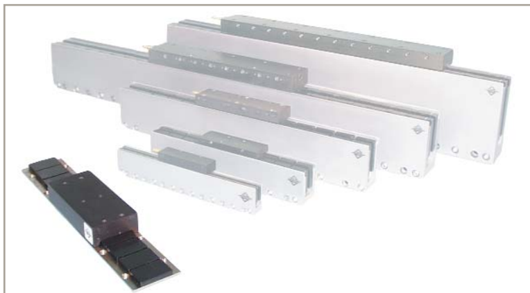
The BLMF is shown with Aerotech's linear motor line.

The moving forcer coil assembly contains Hall-effect devices, and a thermal sensor, and is a compact, reinforced ceramic epoxy structure.