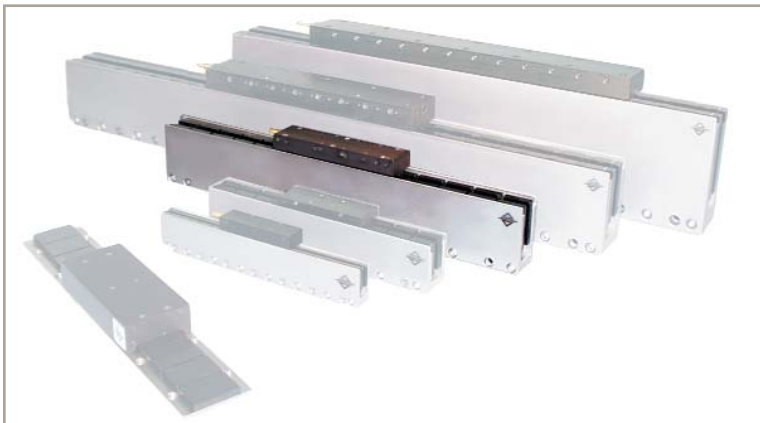
The BLM is shown with Aerotech's linear motor line.

The BLM can be driven using standard Aerotech brushless amplifiers and controllers to provide a complete integrated system.